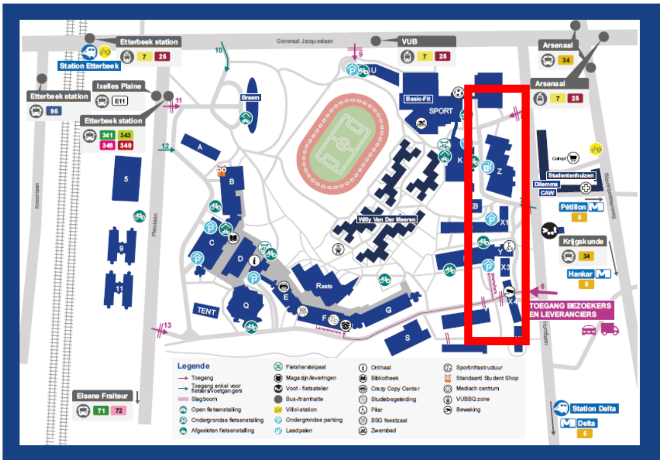
*Red box on plan shows public parking area (via entrances 6 and 8)

If you are in front of the barrier and there is a problem with opening, you can use the intercom. Security staff will then offer assistance.